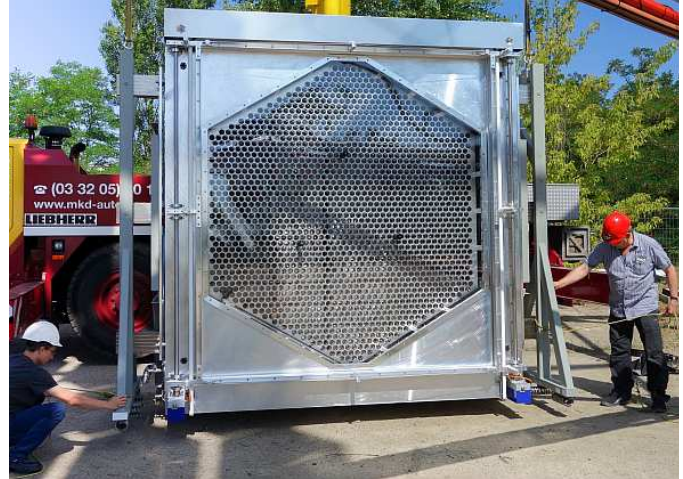
FIG. 6.1 – FlashCam body in Adlershof before installation.

Our group contributes two pre-series camera bodies (funding guaranteed) of the photomultiplier-based first fully digital IACT camera for the mid-sized telescope (MST) which has a 12 m dish diameter [4]. The production of additional fifteen camera bodies starts early 2017, if funding is secured by then. The FlashCam camera, as one of the two MST camera candidates, made an important step towards a fully functional prototype. The past years have been devoted to develop, test and build the enclosure. The main design goals were easy access to all parts for installation and maintenance, a good light and water tightness, low weight at low cost, and a design suitable for mass production. Combining proven techniques and materials used in industry with unconventional construction ideas lead to a 3 \times 3 \times 1.1 \text{ m}^3 body of less than 1.7 tons, including the safety-, power- and filled cooling-systems and most of the cabling. The additional weight of the readout and detector electronics, to be installed in a next step, is estimated to be around 300 kg.