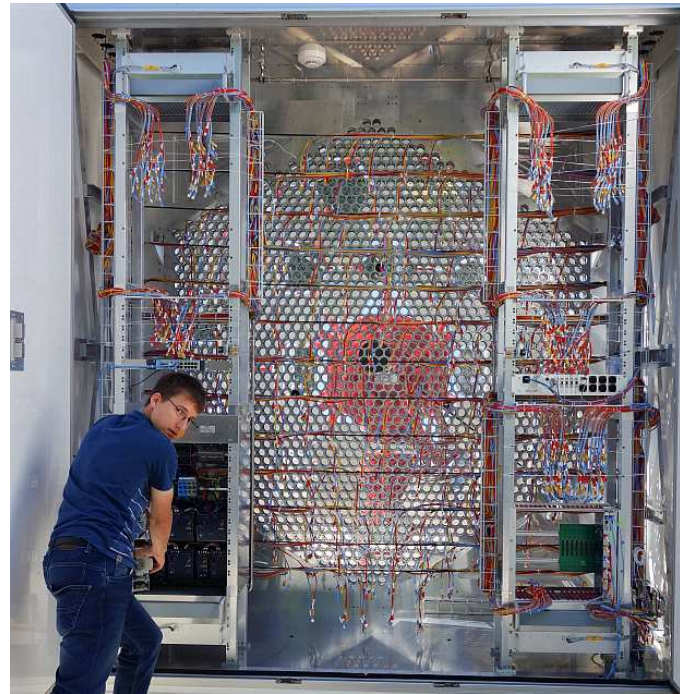
FIG. 6.3 – Camera rear doors open. The safety and power cabinet at the left lower rack position is being inspected. The slow control drawer is installed in the middle of the right rack. Fan drawers and heat exchangers can be noticed at top and bottom of the two racks.

Seventy such modules have been ordered and tested in-house before they were sent last autumn to the MPI-K for their integration into the camera body. A single camera contains 147 PDP modules. A total of 1764 pixels cover a field of view of 7.7^\circ . The partially-equipped camera revealed some problems, which were solved by minor changes of the schematics and the layout of the modules (Fig. 6.4). The second half of the detector modules were ordered by the University of Erlangen. All components, including the readout electronics, will be installed in the prototype camera body during the second half of 2016 to allow testing the functionality of a complete camera.