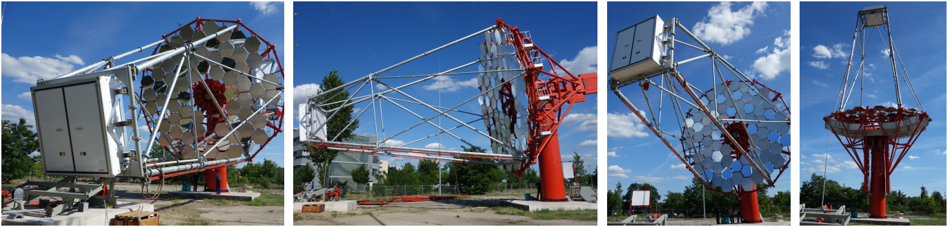
FIG. 6.2 – Rotating the telescope into the zenith position. The sledge, which can be moved with a winch, is visible below the camera body in the first picture. The camera lid is closed and the two installed detectors are read out for off-line study of possible light leaks and pick-up noise.

pump system (without heat exchanger) and was moved to different elevation angles (Fig. 6.2). Two photomultiplier modules with 12 PMTs each (see e.g. last year's report) and a readout crate was used to determine the light tightness of the camera at different elevation angles and also to investigate a possible noise pick-up from the drive system (Fig. 6.3).